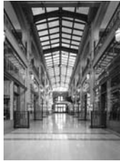
The Grove Arcade