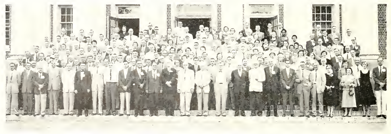
Pictured above are speakers and persons attending the 4th annual Employment Security Institute held in Chapel Hill on September 29-October 1.