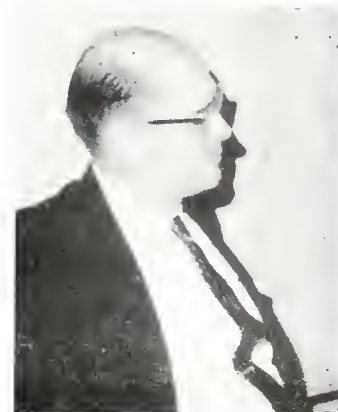
Winston-Salem's Jenkins exemplifies concentration of participants on problems under discussion.