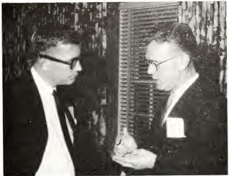
Veeder and Weatherly talk over matters of mutual interest.

Out-of-state participants noted that in many metropolitan areas around the country the municipal governments are controlled by one party and the county governments by another. Where this occurs, cooperation is especially difficult.