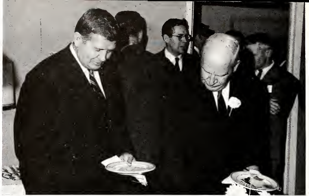
North Carolina's Governor Hodges and Governor-elect Terry Sanford attend buffet luncheon for Seminar.

The late Meyer Kestnbaum, chairman, of the previous Commission on Intergovernmental Relations, summed up the conference by suggesting that in solving metropolitan area problems as other problems, the central problem is that of persuading influential people to make the necessary adjustments and compromises to produce a workable end result. This may or may not involve changes in governmental structure. He felt that the most important lesson to be learned from North Carolina was the example of cross-fertilization of ideas between scholars and practical politicians at the Institute of Government in conferences such as this one.