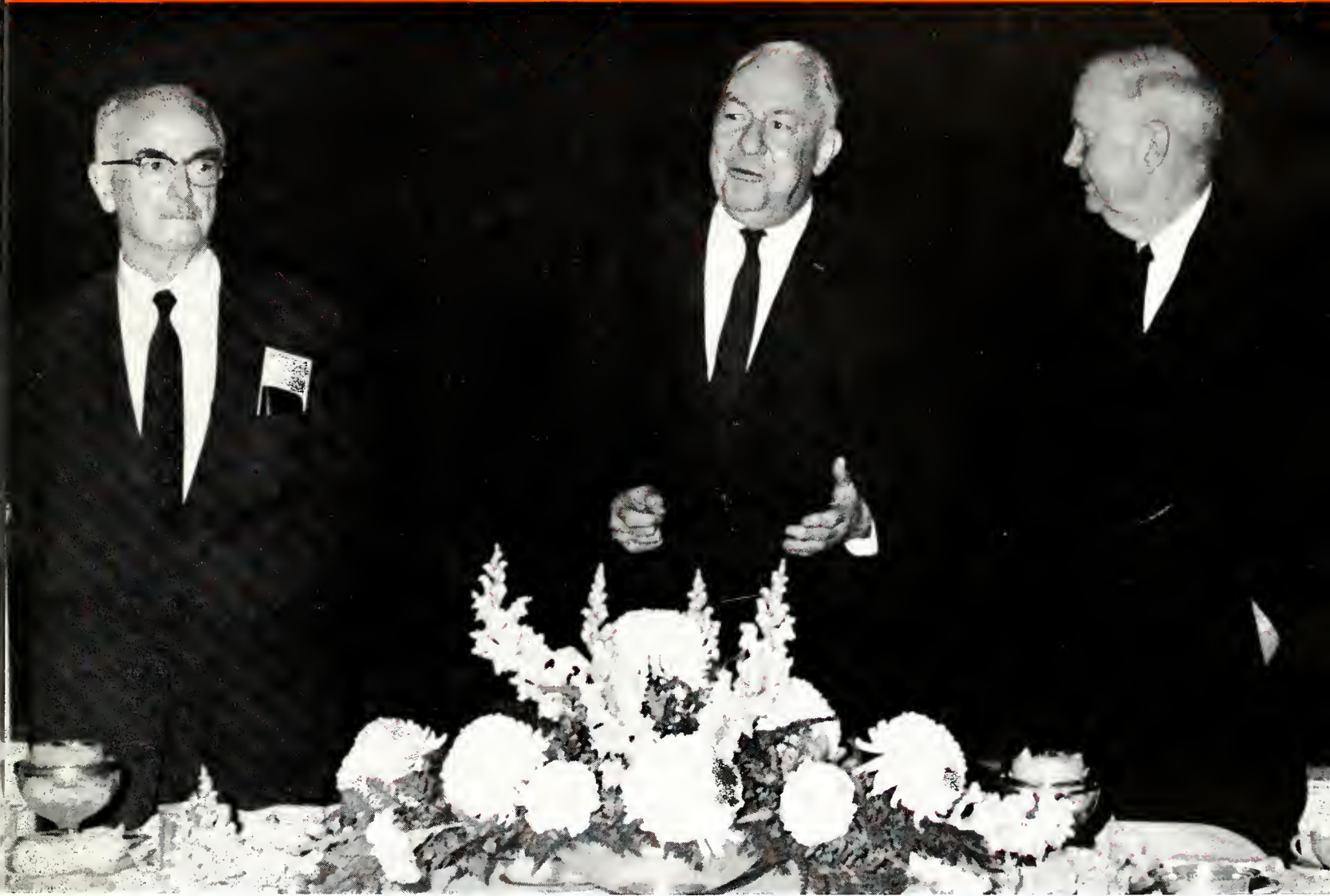
Senator and Metropolitan Area Conference Officials

Published by the Institute of Government UNIVERSITY OF NORTH CAROLINA • CHAPEL HILL