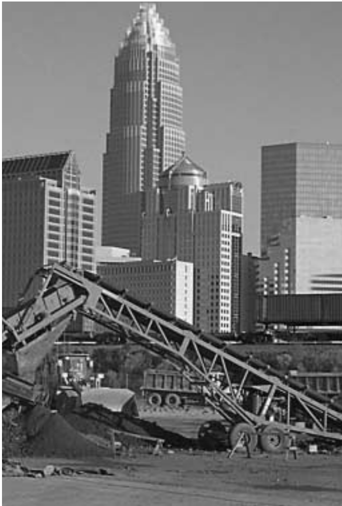
THE CHARLOTTE OBSERVER