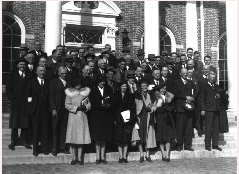
Tax supervisors attending a course at the Institute, early 1940s.