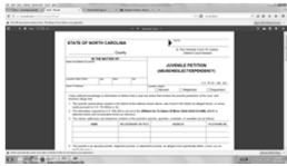
1. Initial petition alleging neglect