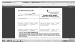
2. Petition/Motion alleging neglect as ground for TPR