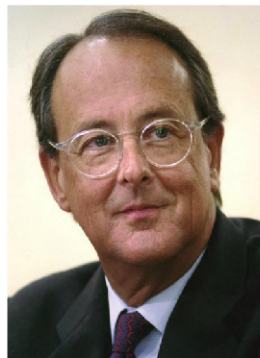
Erskine B. Bowles

Erskine Bowles made a strong call for reducing the federal deficit in "Time of Reckoning: Facing Facts About the Federal Deficit," the 2011 Deil S. Wright Lecture presented at the School on November 3. Drawing upon his experience as co-chair of the National Commission on Fiscal Responsibility and Reform, Bowles emphasized the need for the United States to drastically cut the national