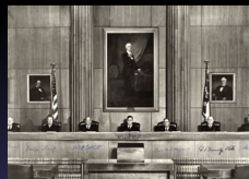
Case law comes from the decisions of appellate courts in specific lawsuits.