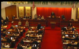
Statutes are laws enacted by the legislature.

Law you see in your work comes mostly from two sources.