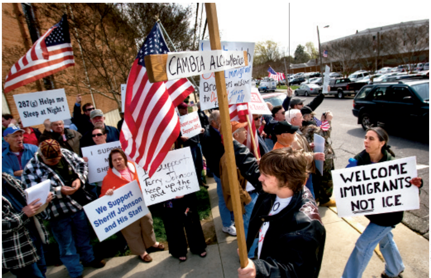
Jerry Wolford / Greensboro News & Record

At the turn of the twentieth century, darker-skinned Europeans and Chinese immigrants experienced strong resentment from lighter-skinned Europeans arriving earlier. Today, Latinos are the target of much anti-immigrant sentiment.