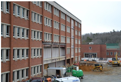
Pictured above-Sanford Hall –May, 2020 Watauga Democrat in 16 Construction Workers at App State test positive for COVID-19 ; this is following a prior cluster of 40 subcontractors with COVID-19

Several residence halls were renovated and several new residence halls were constructed in 2020.