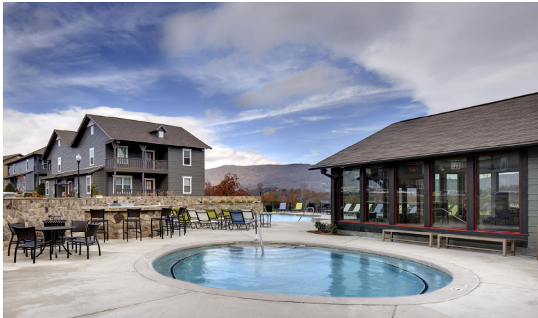
Cottages of Boone housing complex featured. This became a site for COVID-19 testing. AppHealthCare conducted testing at the health department M, W, F and on campus or off campus cluster locations T, Th